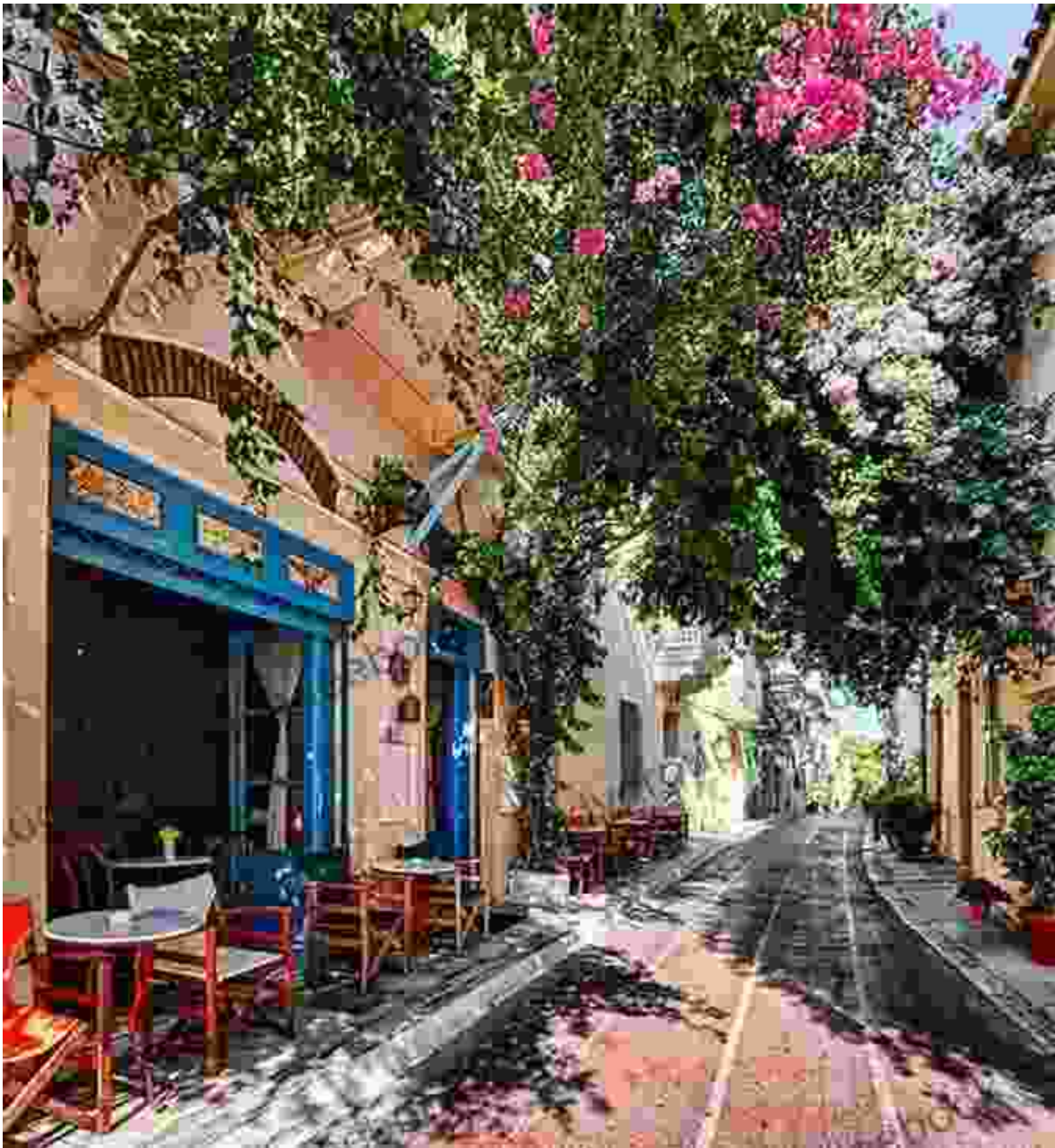
Plaka, a charming labyrinth of narrow streets and traditional buildings

Nestled at the foot of the Acropolis, Plaka is the enchanting old town of Athens, where cobblestone streets wind through charming squares and colorful bougainvillea cascades over whitewashed houses. Stroll along Adrianou Street, the main artery of Plaka, lined with traditional shops, cozy cafes, and lively tavernas.