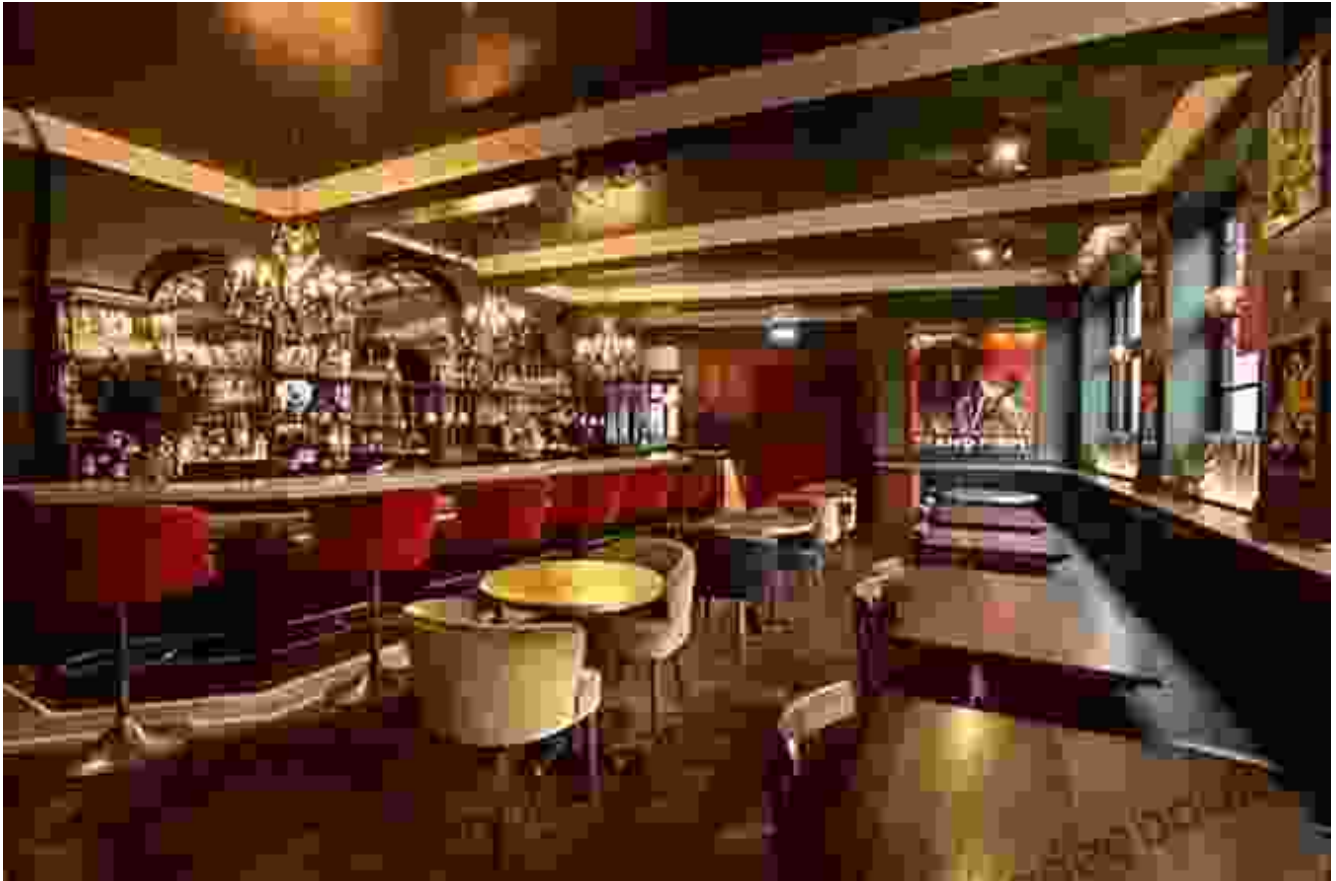
The Blue Room nightclub at the Bedford Hotel